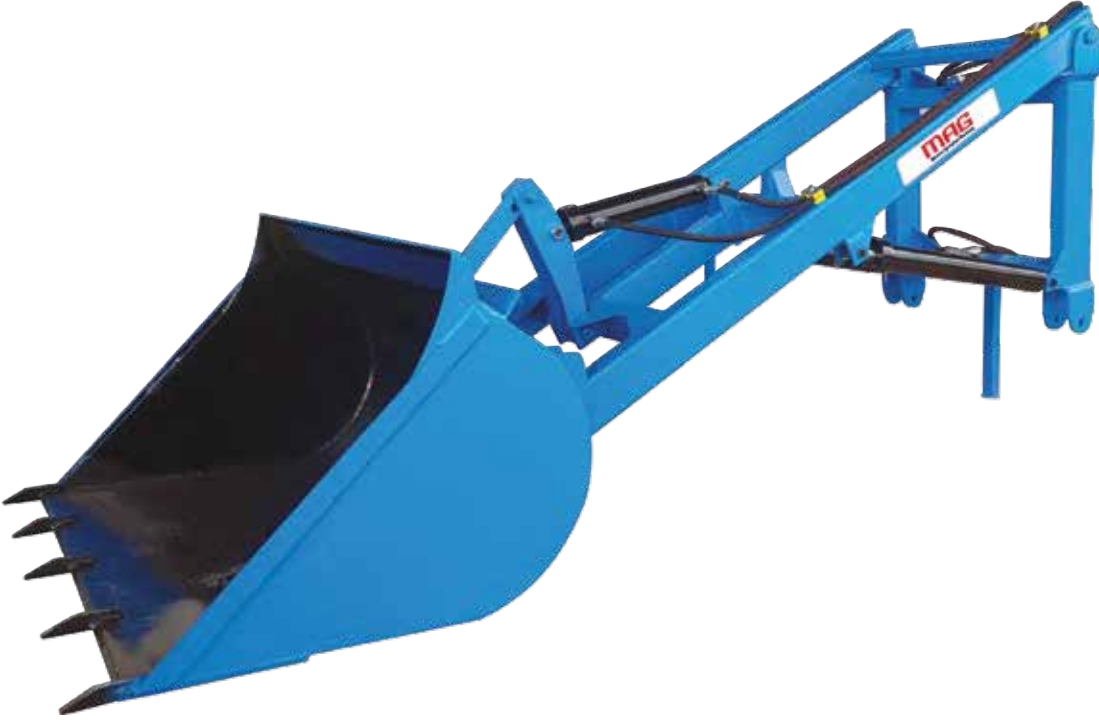
DEVİRMELİ KEPÇE TILTING BUCKET