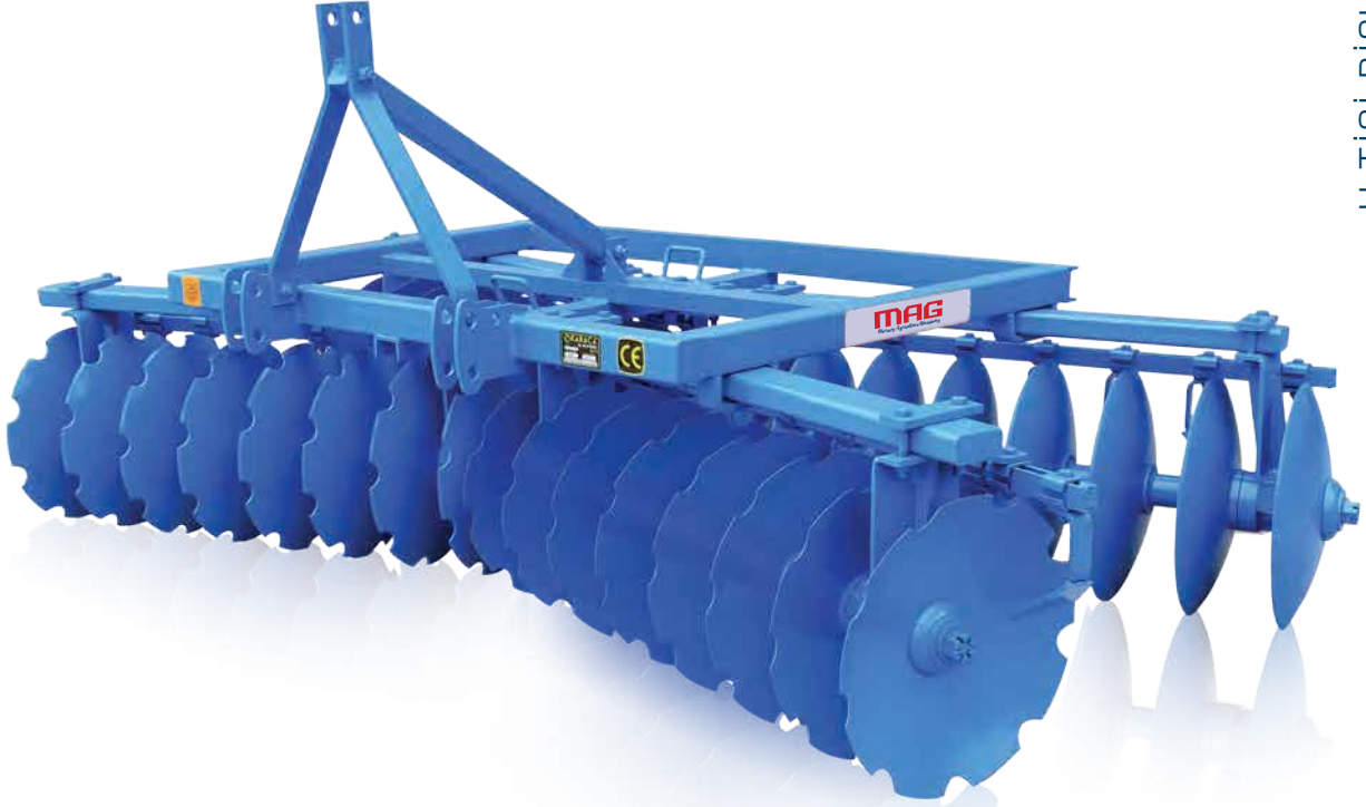
X TİPİ DISKARO X TYPE DISC HARROW