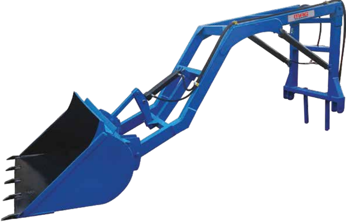
EĞRİ KEPÇE CURVE BUCKET