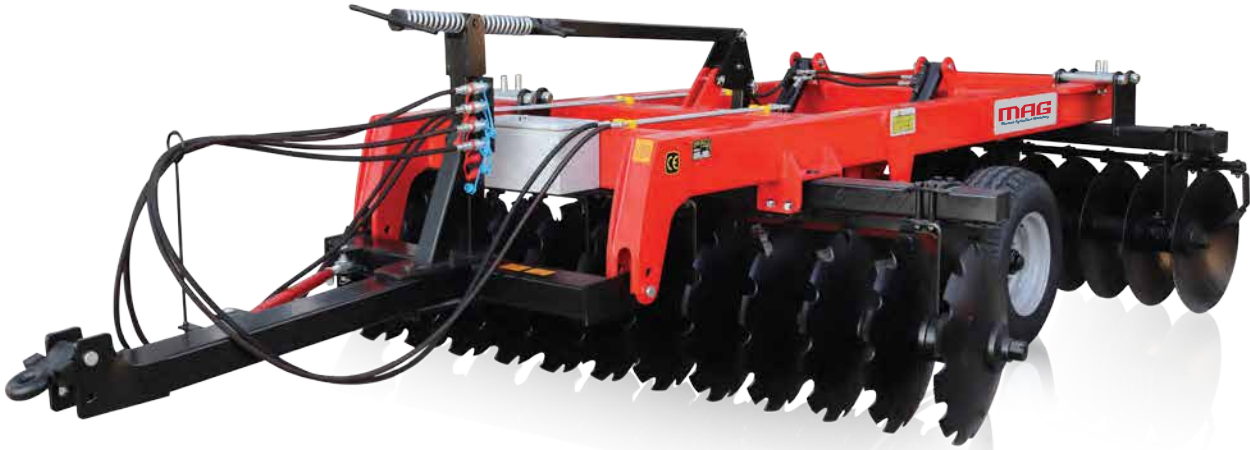
HERKÜL/SÜPER GOBLE DİSKAROU SUPER DISC HARROW